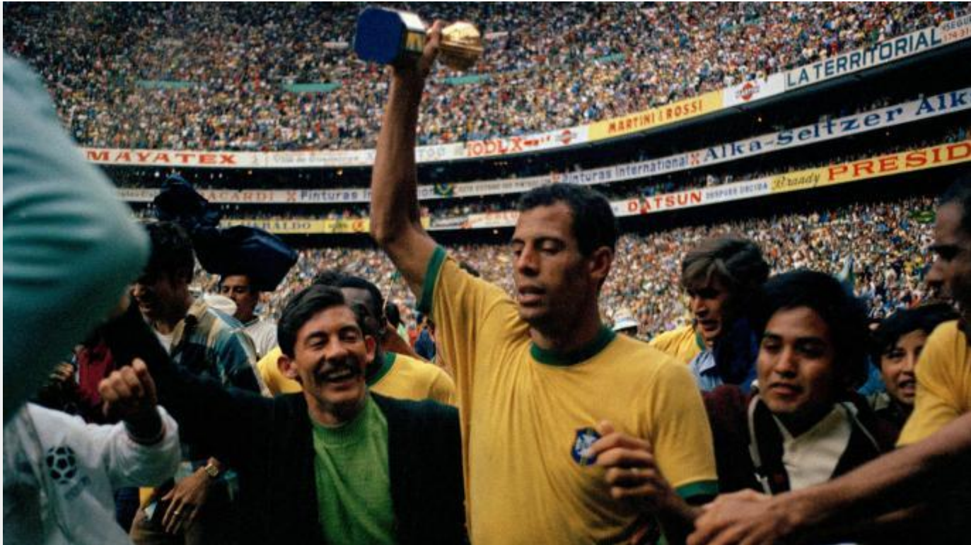
Alberto parades the Jules Rimet trophy in the Azteca Stadium after Brazil's 4-1 victory over Italy in the 1970 World Cup final

This tells us much about life. You cannot understand a symphony through an analysis of its individual notes, but only by confronting it as a living whole. In the same way, the greatest teams and organisations (and perhaps even nation states) can only be comprehended by appreciating the collaboration and empathy that enable them to excel.